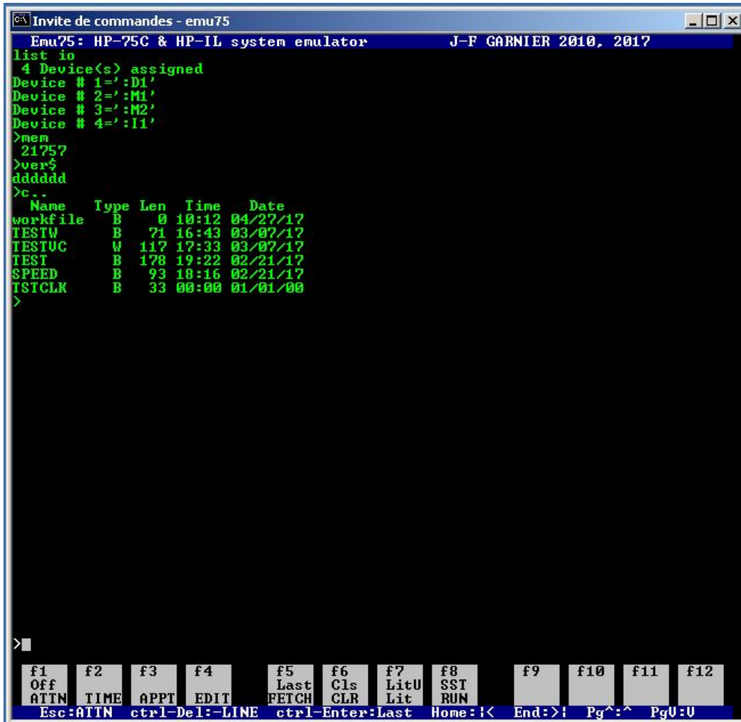
Emu75 running in 50-line mode in a command box on a Windows 2000 system

Emu75 is a software emulator of the HP-75C machine.